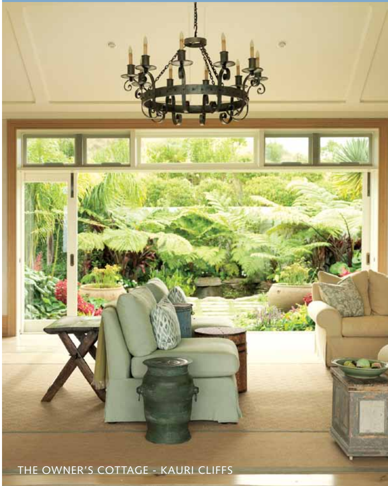
THE OWNER'S COTTAGE - KAURI CLIFFS

KAURI CLIFFS AND THE FARM AT CAPE KIDNAPPERS OFFER THE ULTIMATE 'HOUSE PARTY' HOLIDAYS WITH AN ULTRA-LUXE OWNER'S COTTAGE AT EACH PROPERTY