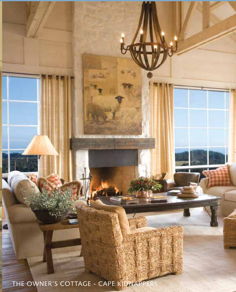
THE OWNER'S COTTAGE - CAPE KIDNAPPERS

Perfect for birthday celebrations, anniversaries, family gatherings or convivial get togethers with groups of friends. A stay at the Owner's Cottage at Kauri Cliffs and The Farm at Cape Kidnappers feels more like enjoying the vacation home of a very stylish friend, who has kindly left the keys and the staff at your disposal!