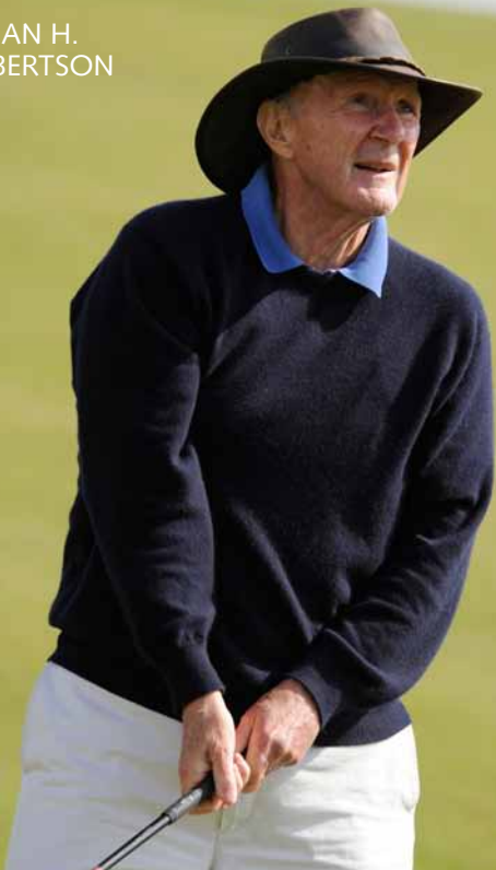
JULIAN H. ROBERTSON